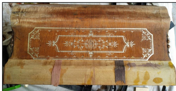
The painted pattern on one side of the cover

Martin used a flat piece of timber with quarter round beading to clamp the veneer to the cover. It required quite a few clamps to ensure that the veneer was evenly fixed onto the rounded part of the cover