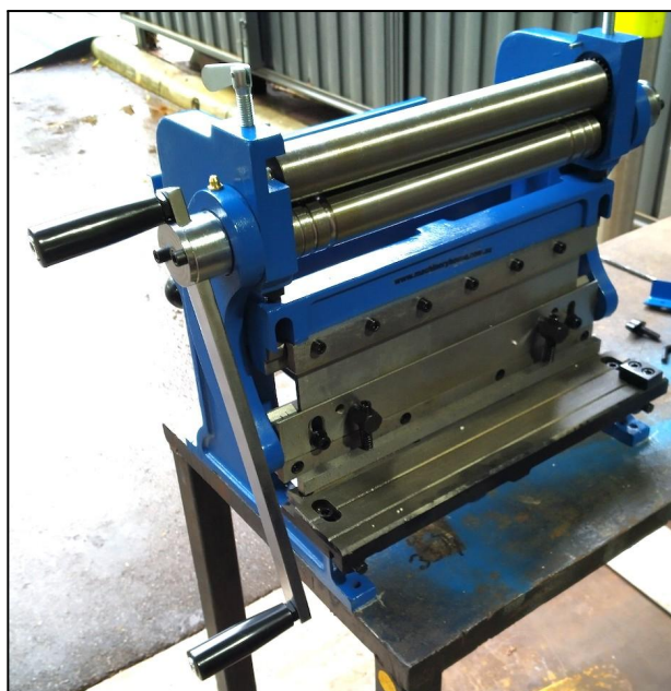
The 3 in Hafco 1 Folder, Guillotine, and Roller Machine

A folding or braking press above the guillotine can be used to bend sheets of metal up to 1mm thick (20 gauge) and up to 305mm (12 inches) wide to an angle up to 90 degrees using different angled breaking dies. Note that the machine only has the 90 degree die fitted.