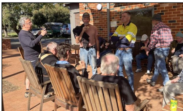
Various Groups of Members at the BBQ