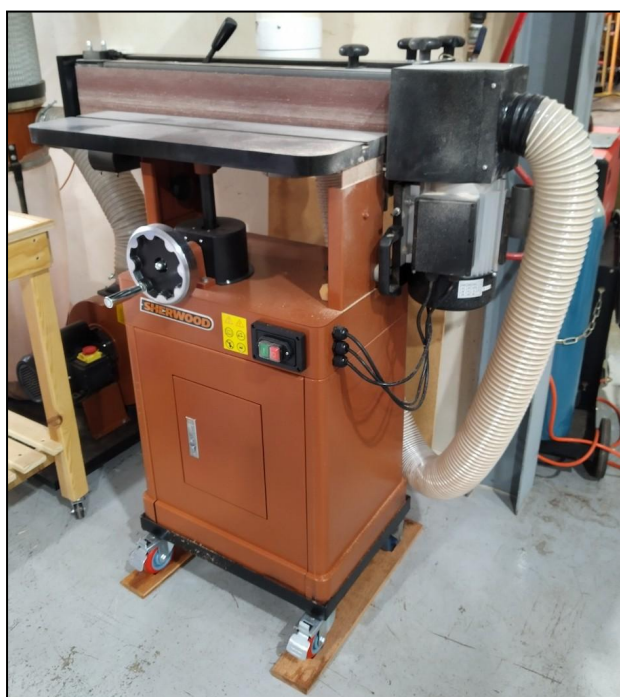
The Sherwood Belt Sander

The Old Hafco Belt Sander, located in the Wood Workshop near the door into the Metal Workshop, has been replaced by a new Sherwood model.