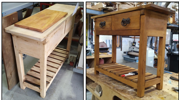
The BBQ table cleaned up and after staining

A client brought in an outdoor BBQ table which had suffered some damage due to being exposed to the weather but was otherwise structurally sound. Allan Waugh undertook the job of cleaning the table back to the original pine. Ken McCrackan and Ben Gunawardena then took on the job of adding two coats of stain finish.