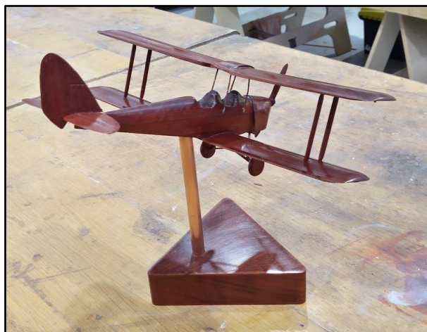
The finished Gypsy Moth on the stand before the commemorative plaque was added.