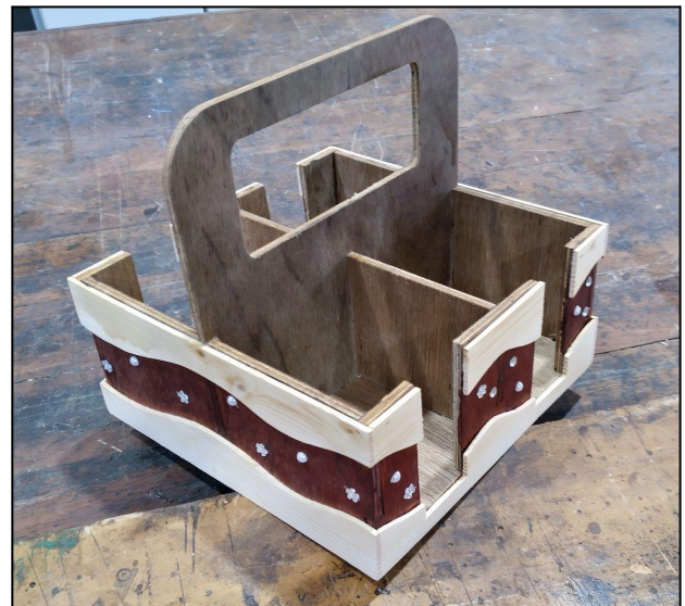
A finished caddy with a decorative finish