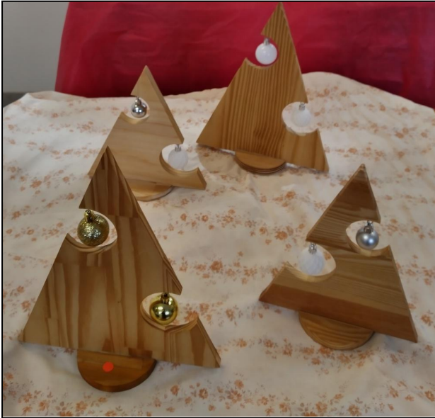
Wooden Christmas Trees made by the Women's Group