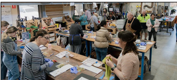
A full Shed at the first workshop

The first workshop was held on the Saturday 19th August 2023 and attendees were helped by Shed Members to go through the process of creating a beautiful necklace and earring set. Attendees were able to choose from two different designs with each design incorporating polished timber and beads.