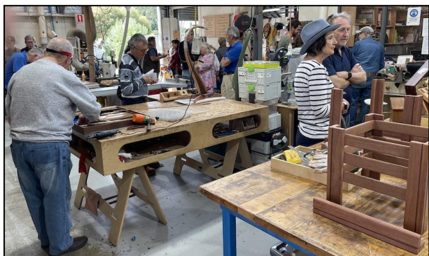
Demonstrations and Discussions in the Shed

Demonstrations were given by Shed Members in the Wood and Metal Workshops and other Shed Members showed people and prospective Members the Shed facilities.