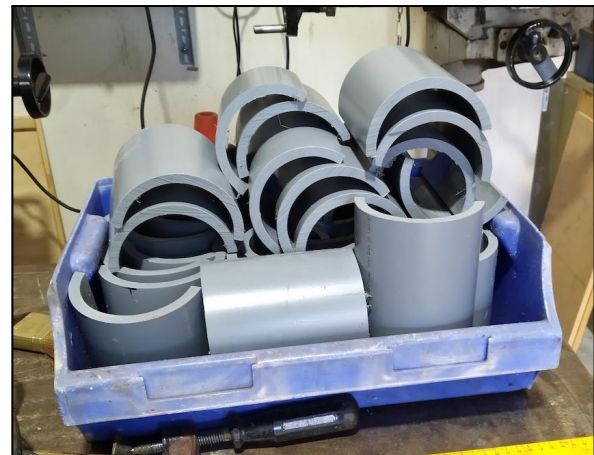
The Mouses Houses ready to go

We have been asked to make 10 lots of 1000 of the houses. James Turner has taken on the job which he expects to extend over a few months. He has made a jig to fit onto a circular saw to make the long cuts needed to split the pipe into two halves.