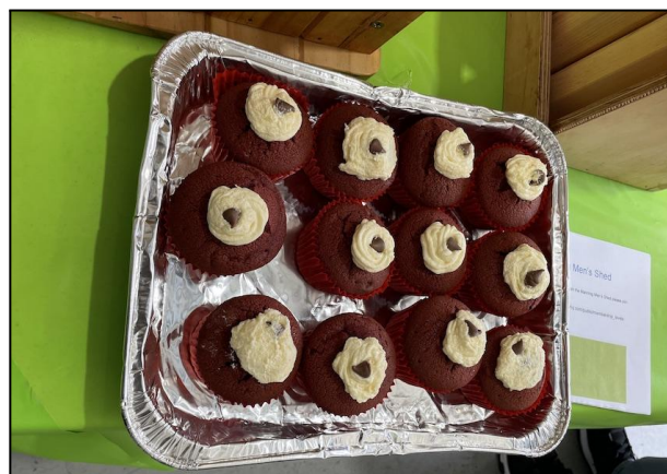
A sample of the cupcakes