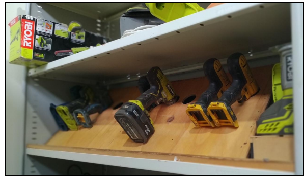
Battery Operated Drill Storage Rack

Eric used timber he recovered from the recent Busy Bee throw out pile.