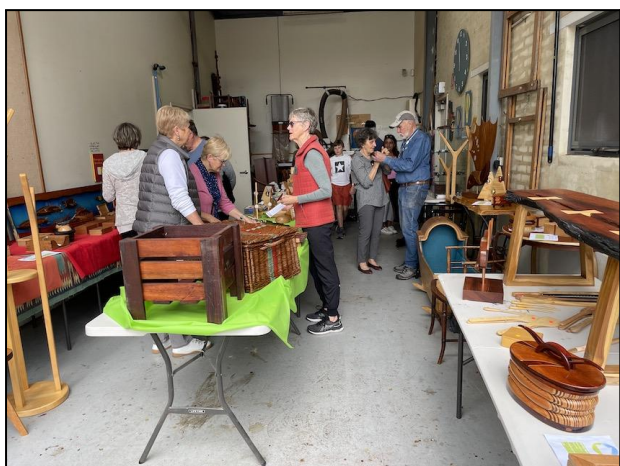
Items for display in the bus garage area

Items for sale were placed in tables in the bus garage and on the workbenches in the Wood Workshop