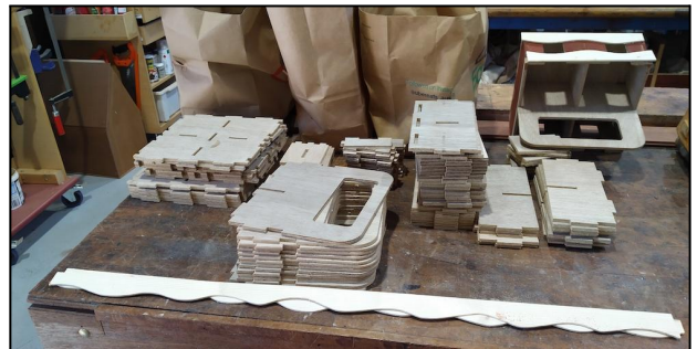
The caddy kits ready for the workshop

The second workshop was held a week later on Saturday 26th August 2023 and attendees were helped by Shed Members to assemble pre-cut wooden caddies and add decorative finishes to them.