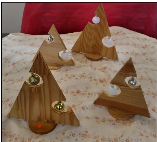
Women's Group Christmas trees for sale

We mentioned that the Women's Group had small Christmas Trees with bangles on sale at the recent Open Day. There are still some available for sale.