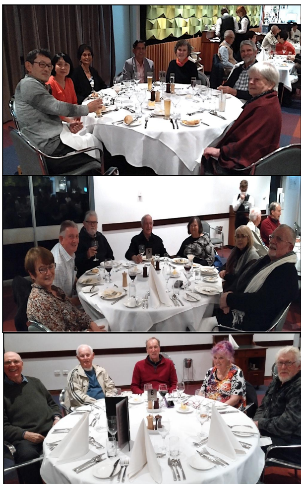
Shed Members and partners at the Pines Restaurant

On the evening of Wednesday 17th August about 20 Shed members enjoyed a social evening out with their partners at the Bentley TAFE Pines Restaurant. The restaurant is opposite Curtin University in Hayman Drive and is a training facility for students studying certificates in the hospitality industry.