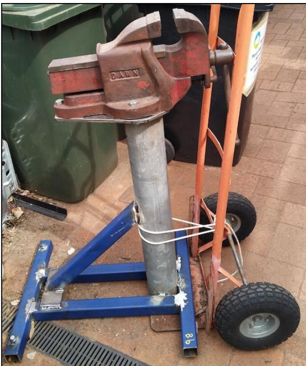
The mobile vice frame

Two small wheels on short pieces of square tube, which fit inside the ends of the rear cross bar, enable the frame to be moved around.