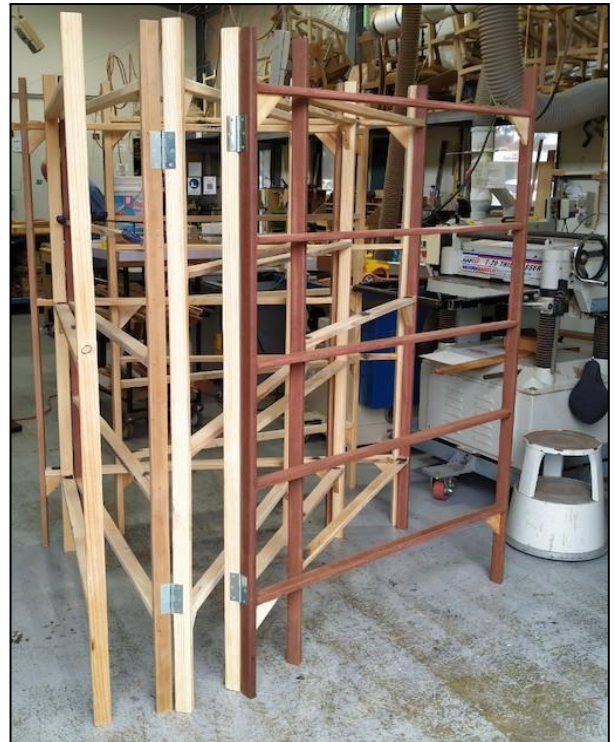
The three sets of panels for hanging quilts

The panels were made for the Swancare Show Committee at Bentley Park to hang quilts and other display items at their annual show.