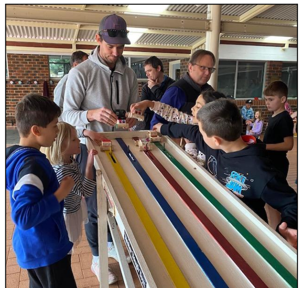
Children and their families assembling the cars