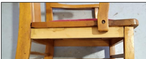
The arm rest support fitted to the seat with the new strut under

The damage occurred where the arm rest support is attached to the seat. The arm rest is held by wood screws so was easy to remove, to allow the work to be done, and refitted. Martin also had to replace one of the side support struts under the seat.