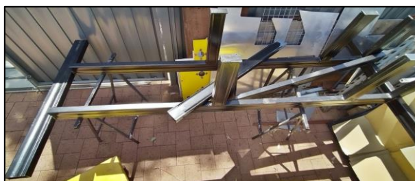
The Shelf Racks stored out the back after painting

As part of the work to arrange storage of items in the container James Turner has welded up some steel frames. These frames will allow the longer thinner pieces of timber to be stored vertically.