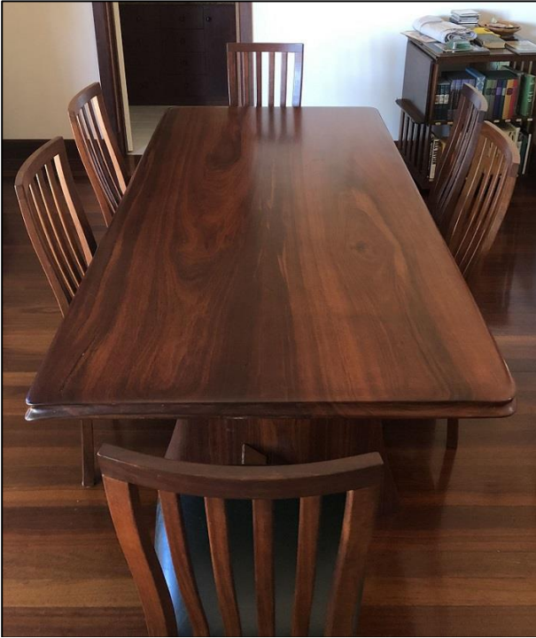
Graham Rennie's Jarrah Dining Room Table

The next project is not strictly a table but looks like one! Its Peter Cullinan's jarrah bench top made from a number of machined 4 by 2 beams glued together. Due to its size, it needed 5 large sized sash clamps. Just a big chopping board really!