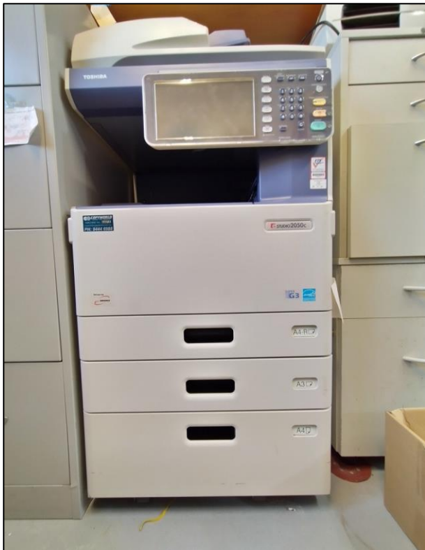
Toshiba e-Studio 2050C Multifunction Printer/Copier/Scanner

The smaller Brother printer is limited to black and white A4 sheets.