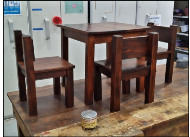
Child's Table and Chairs finished