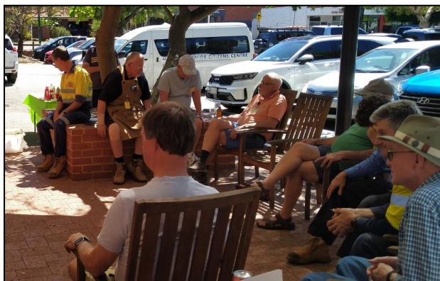
More Shed Members enjoying the BBQ

Greg Milner, the Mayor of the City of South Perth, also attended the BBQ.