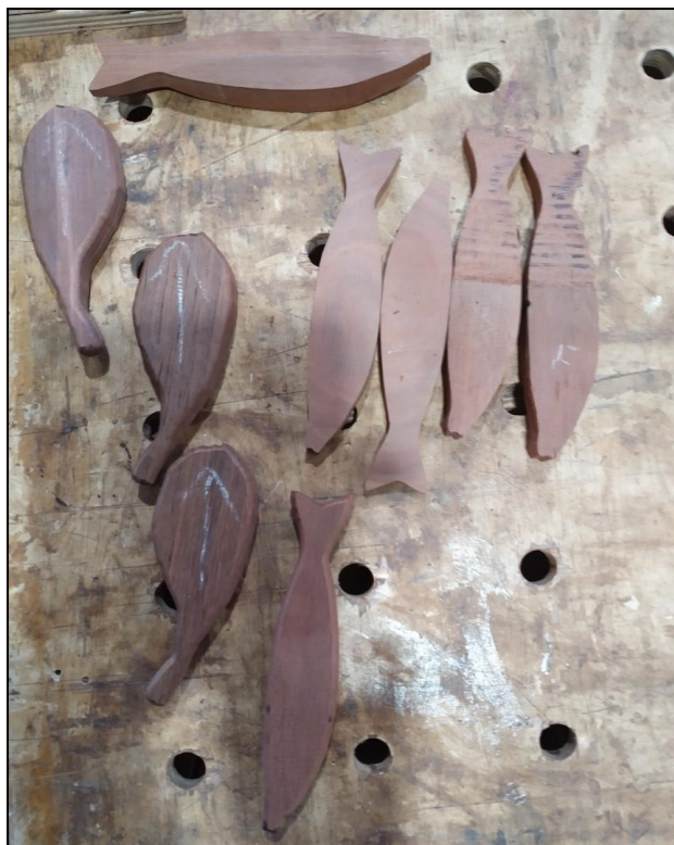
More of the fishes!!