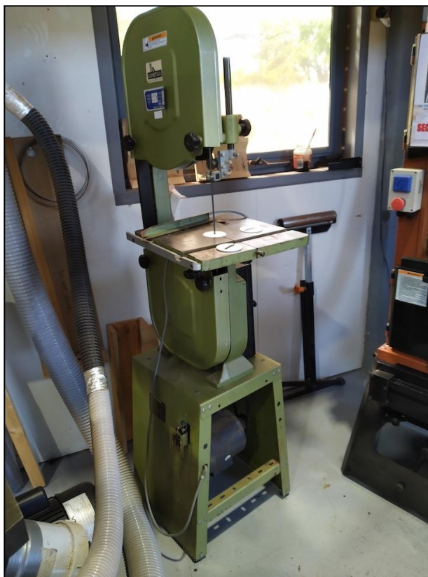
The Sontax Woodworking Bandsaw.

Shed members will be advised when it is ready for use. Note that the Shed's Training and Assessment rules apply to this machine