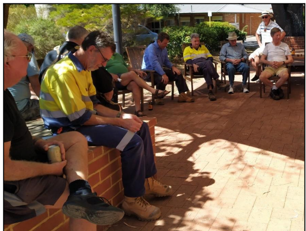
Shed Members enjoying the BBQ