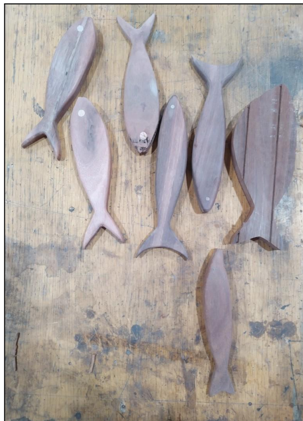
Some of the fishes

The situation is under investigation by the Hon Editor and further information will be published in the April Newsletter.