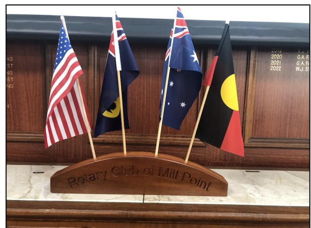
Rotary Club of Como Flag Stand

Last year we made a couple of small flag stands for the Rotary Club of Como. We recently received a photo of one of the stands in use.