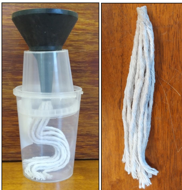
Horse Tail Jig (left) Tail ready to fit (right)