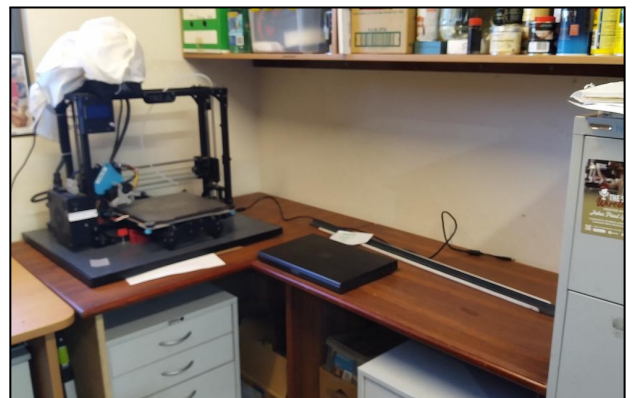
The new desk extension installed