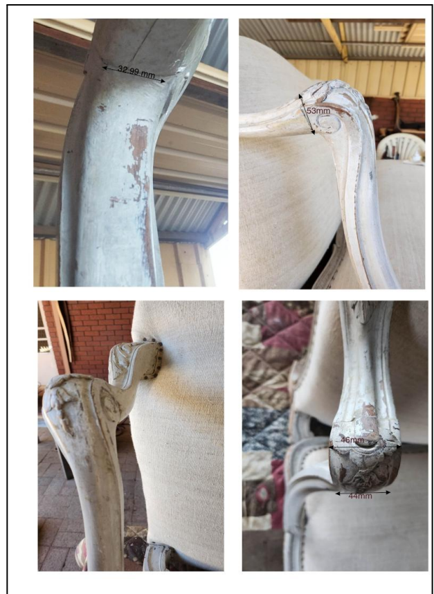
Details of the "knuckles"