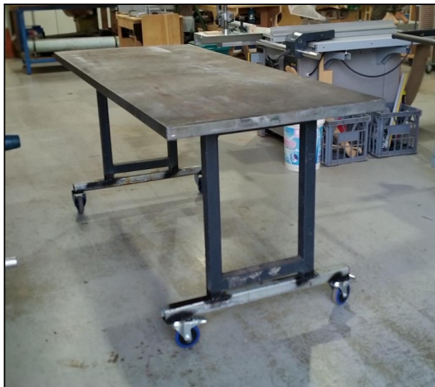
The Wide Wheel Base Trolley