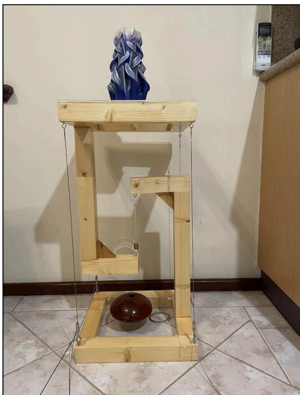
Ben Gunawardena's Floating Table

Ben Gunawardena has made a table with a difference. It is held together by steel cables but there is a gap in the middle of the leg which seems to defy gravity. It is called a Tensegrity Table. Tensegrity is the shortened form of Tension Integrity and is defined as a structure containing 2 or more components which are connected only by string or cables in tension. This gives the impression that the top component is "floating" in the air.