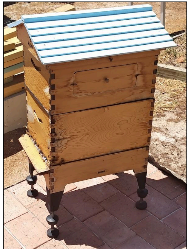
The Beehive - the bees can be seen on the small shelf

The Beehive group have now installed the beehive in the Shed garden and the bees are as busy as .. well bees.