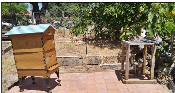
The beehive looking towards Ley Street