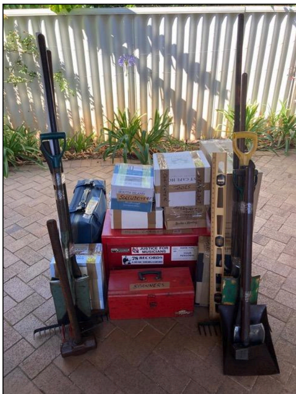
Boxes of tools ready to go to East Timor

hand tools for the farmers in East Timor.