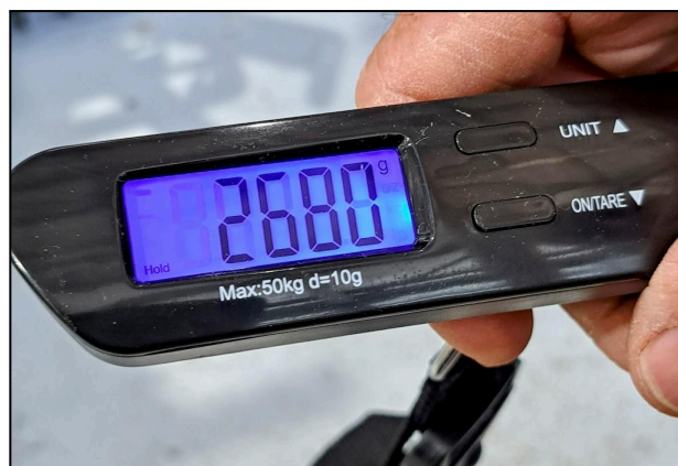
The weighing machine display

So here he was with one boot off, holding a digital weighing machine attached by rope to his boot with a big mallet stuck in it, and pulling it across the garage floor. The meter on the weighing machine shows the force (in milligrams) needed to move and drag the boot across the floor.