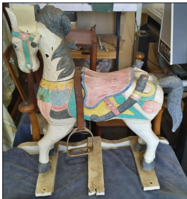
The intricately carved horse

The client also wants the rest of the rocking horse to be refurbished and repainted. The rocking horse is intricately carved and sanding it back to the original timber and then re-painting it will be a major job..