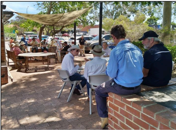
Shed Members enjoying the BBQ in the outside covered area