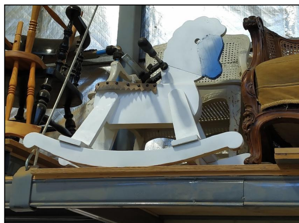
The Little White Horse