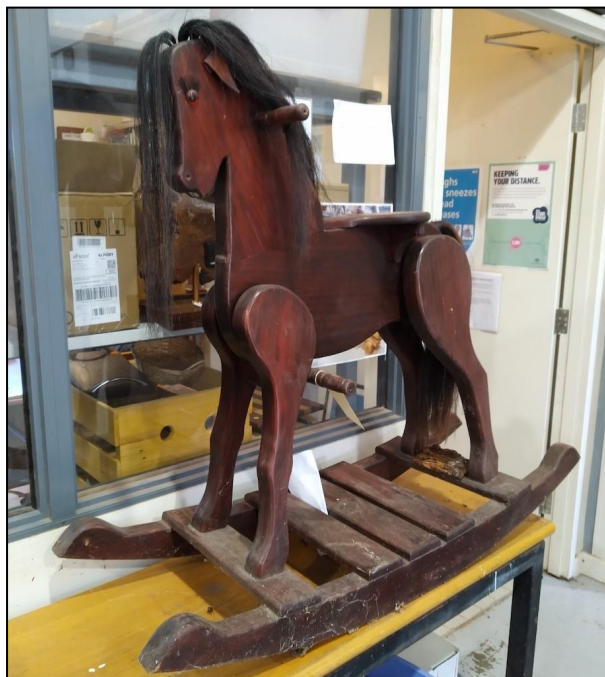
The Big Brown Horse

There is the big brown one which is stabled next to the Crib Room door waiting for some tender loving care.