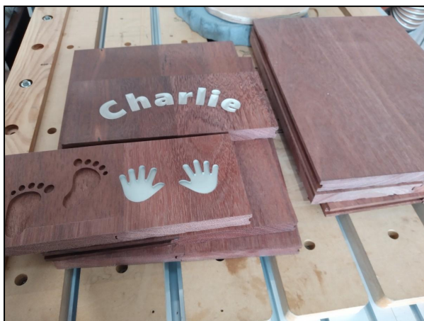
Childrens Door Signs

Lately he has cut some door signs for children's doors.