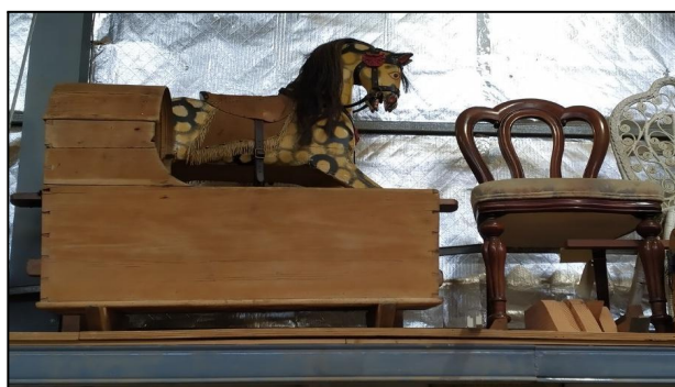
The furniture items donated to the Shed