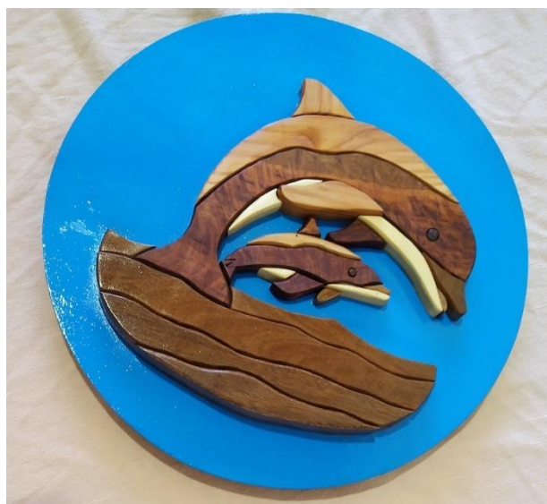
The pouncing Dolphins glued onto the background board

Once assembled John applied clear lacquer to highlight the grain. Because each part was made from a different type of timber this resulted in a contrast between the parts.