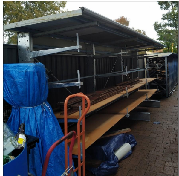
The racks with the top covers and shelf boards fitted

The cantilever struts have been fitted to the back frames and have a short round post at the front to stop stored lengths of timber falling off. Peter has fitted metal struts and plywood boards across the struts to allow timber lengths shorter than a bay width to be stored.