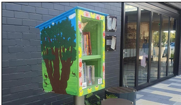
The Little Library at the Manning Community Hub

The Little Library is installed in the laneway in the Manning Community Hub opposite the Box Gallery the Shed constructed. Local residents and visitors have been invited to explore the collection of books available, from classic novels to children's stories, the diverse selection caters to a wide range of interests.