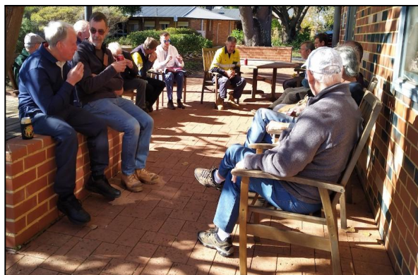
Shed members with Greg Milner (in the white shirt top centre).

One of our guests was the Mayor of the City of South Perth, Greg Milner.