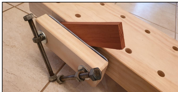
The finished workbench