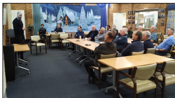
Mens Cancer Talk

About 16 Shed Members attended the very informative talk.