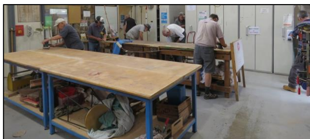
The Bench Cleaning Gang at work!!

A substantial amount of unwanted and unusable items was removed from the back of the Shed and disposed of into a skip. The work benches in the Wood Workshop were cleaned and sanded and the air extraction pipework was modified.