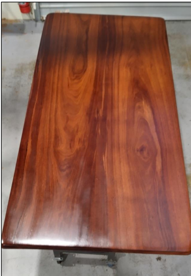
Graham Rennie's Table Top showing the jarrah grain

Tables are second to chairs in the refurbishment department and to keep the tradition going Graham Rennie brought in a large jarrah table to renovate.