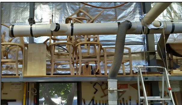
Shortened main pipe and the gate on the drum sander

Over the Christmas/New Year break the main large diameter pipe on the dust extractor system was shortened. This was done to reduce leakage and improve air flow in the pipes on the remaining system which is now restricted to the eastern third of the Wood Workshop (where all the large machines are now located).