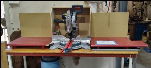
Backboard and Shroud on the Bosch Combination Mitre Saw

The Bosch Combination Mitre Saw has also been fitted with a back board and shroud around the saw to limit the spread of sawdust and to direct it to the dust extraction hopper below the saw.