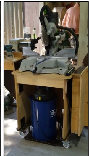
Festool Saw Dust Extractor

The Table Saw now has a gate where the flexible pipe connects to the bottom of the dust collection chute on the machine.