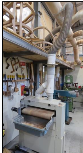
Drum Sander Gate

The Festool Combination Mitre Saw has its own dust extraction unit and is not connected to the main dust extraction system.