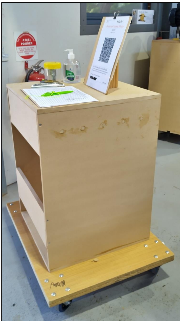
The new Signing In mobile trolley

The Signing – In items previously just outside the Crib Room door have now been relocated onto a mobile trolley just inside and to the left of the front door to the Shed