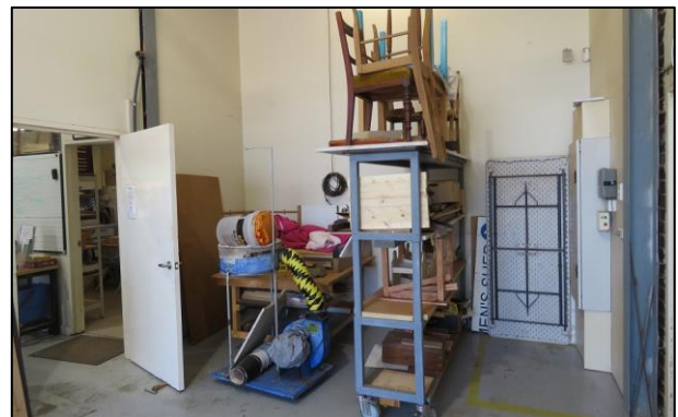
The Client Project Storage Shelf and the CNC Router

The wooden chairs that were originally in the Crib Room have been relocated with the other similar chairs on the overhead storage shelf in the Wood Workshop. The Crib Room shelf unit will be solely used as a display unit for items made in the shed that are for sale.