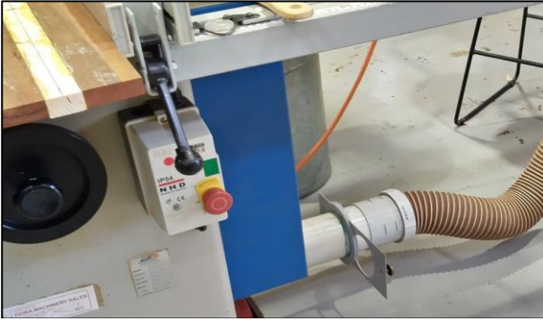
The new gate on the Table Saw

The Bosch Combination Mitre Saw has also been fitted with a back board and shroud around the saw to limit the spread of sawdust and to direct it to the dust extraction hopper below the saw.