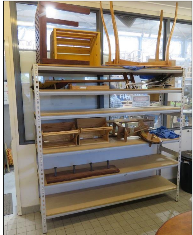
Display Shelf Unit in the Crib Room

The shelf unit that was previously against the east wall behind the door to the Wood Workshop has been relocated into the Crib room against the large window overlooking the Wood Workshop.