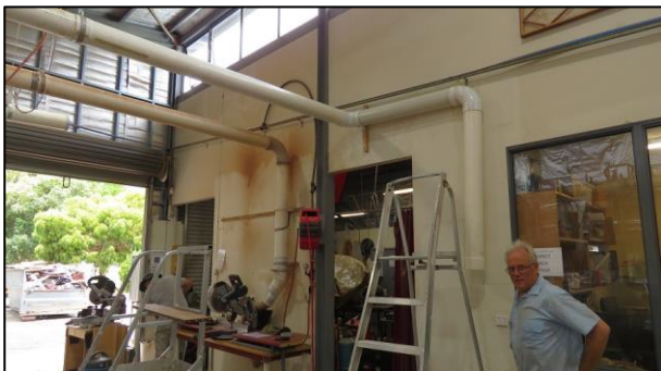
The Pipe Gang (note the FULL skip outside on the left)