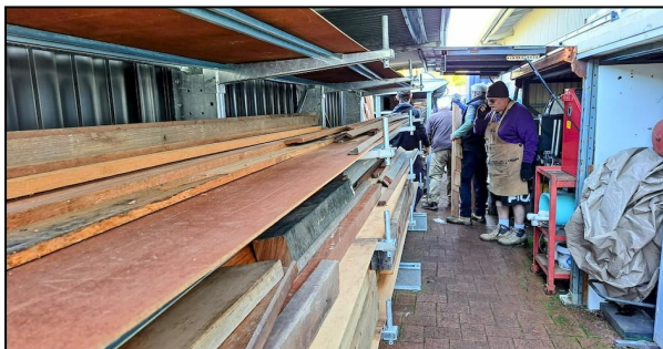
Long timber on the new rack

These are now in use and neatly stacked with timber