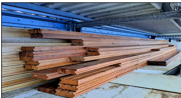
Shorter lengths on the old racks