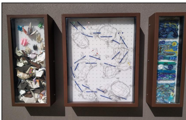
Some of the new boxes with craft items displayed