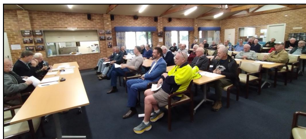
Shed Members at the AGM

new Constitution which had been approved as part of the Incorporation process.