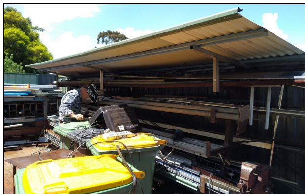
James Turner welding the shelves under new steel roof

The storage racks for the various lengths of metal in the area at the back of the Shed have been remodelled to make the storage of different lengths of metal easier and tidier.